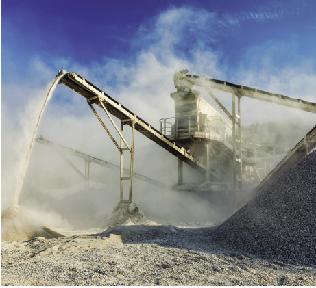
Figure 1: Jaw crusher.